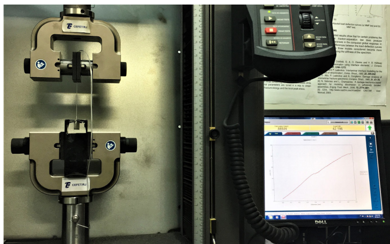
Fig. 3. Instron machine and RTC clamp

The Instron machine, model 5966, with a load cell of 10 kN, was used in the laboratory of composites and adhesives (LADES) of CEFET/RJ. This machine needed to be adapted with a Restrained Top Constraint (RTC) clamp for anchoring the specimens and performing the pull-out test (Fig. 3). In addition to assisting in fixing the block of the test piece, the clamp has a sufficient opening for the passage of the fiber. The use of the RTC